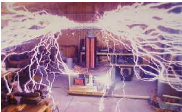
Maxi-Pig #1 during initial test phase?